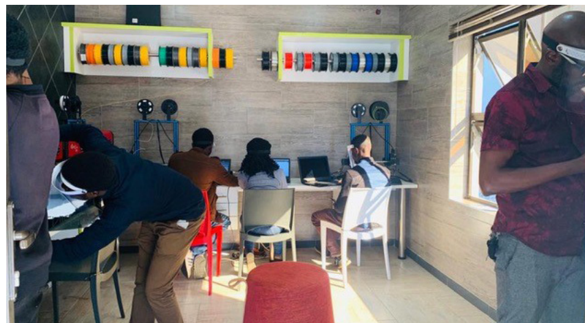
Above: Twenti Makerspace in Malawi.

The project employed 25 people, with 10 trained in digital fabrication. Within several weeks, they had printed 1,000 reusable face masks that they donated to Kamuzu Central Hospital in Lilongwe and a further 1,000 for Queen Elizabeth Central Hospital, Blantyre, with an additional 168 face shields to Chisawani Rural Primary School, Mpemba, Blantyre. Over 3,000 shields were sold to local small businesses.