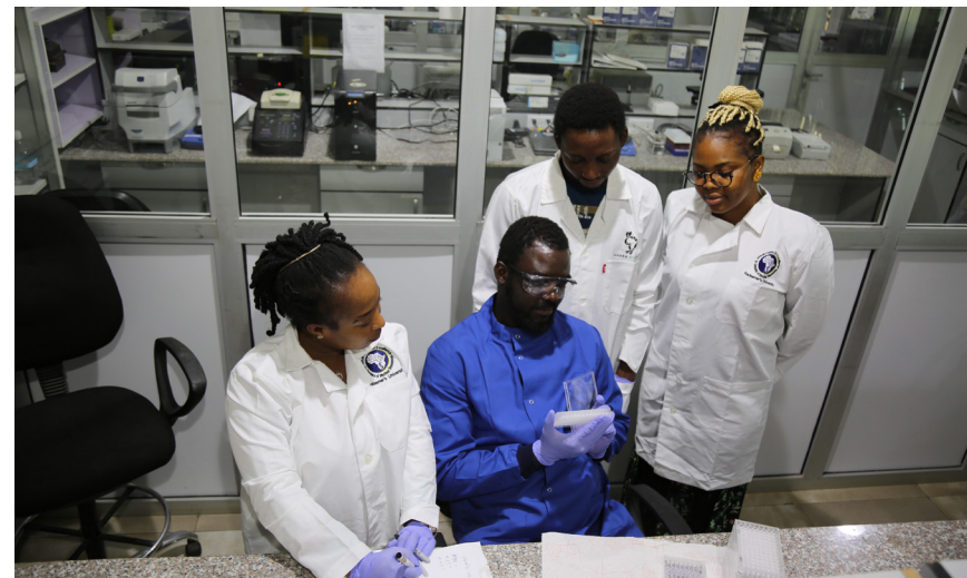
Above: In the laboratory.

This would be achieved through comparing the immune responses of 100 COVID-19 survivors with those of 50 healthy individuals plus 50 stored samples collected before the pandemic began. B cell, T cell and cytokine responses were studied.