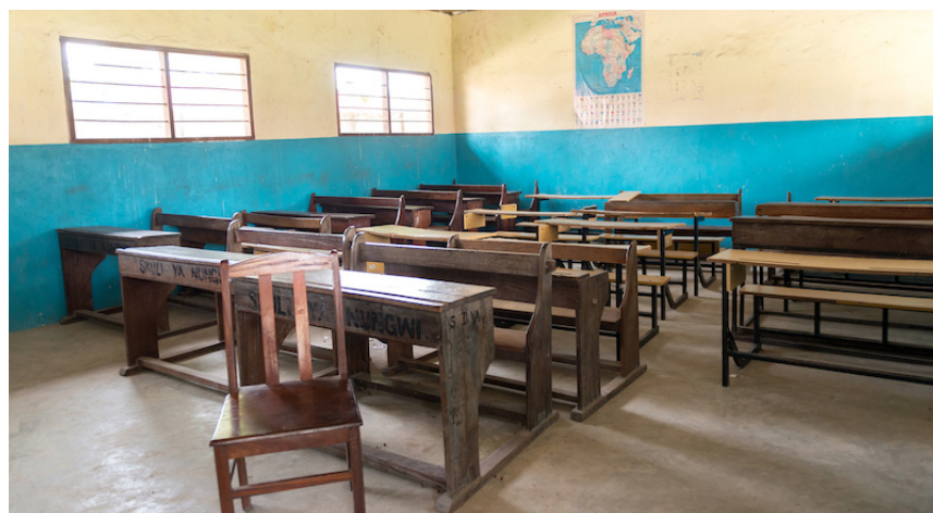
Above: An empty classroom in Ethiopia.

A total of 127 schools from 7 regions across Ethiopia participated in the study which was conducted through phone surveys. A total of 316 teachers and 127 school principals were recruited into this study. The scientists studied the support that school heads and teachers were able to give parents and students during lockdown and what they considered to be priority areas when schools re-opened.