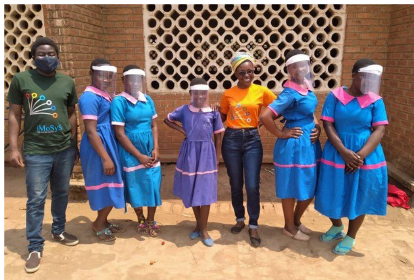
Above: Children from Chisawani Rural Primary school, Mpemba, Blantyre, Malawi – Wearing face shields donated to them from Twenti Makerspace.