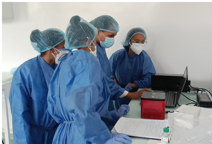
Above: UoA team running qPCR on the Mic qPCR machine (red machine on desk) supplied by the Alborada Fund.

In Madagascar, the plan was to use the machine primarily in the main laboratory at the University of Antananarivo, but also for a few days a week in a rural healthcare centre in Imerintsiasosika, thereby providing greater geographic coverage.